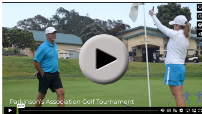
2022 Golf Video