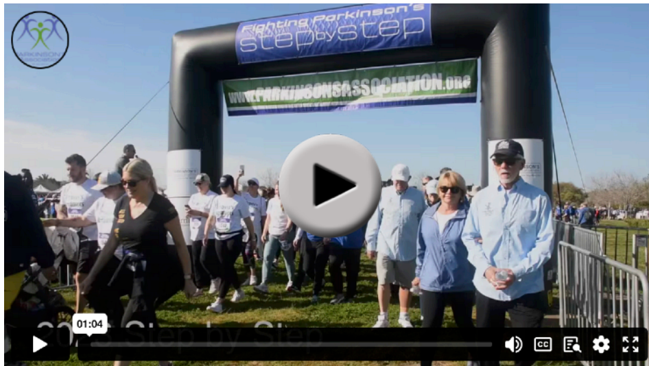
2023 Step By Step Video

NOTE – Absolutely no fundraising allowed.