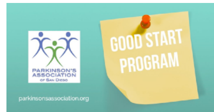
Good Start Program