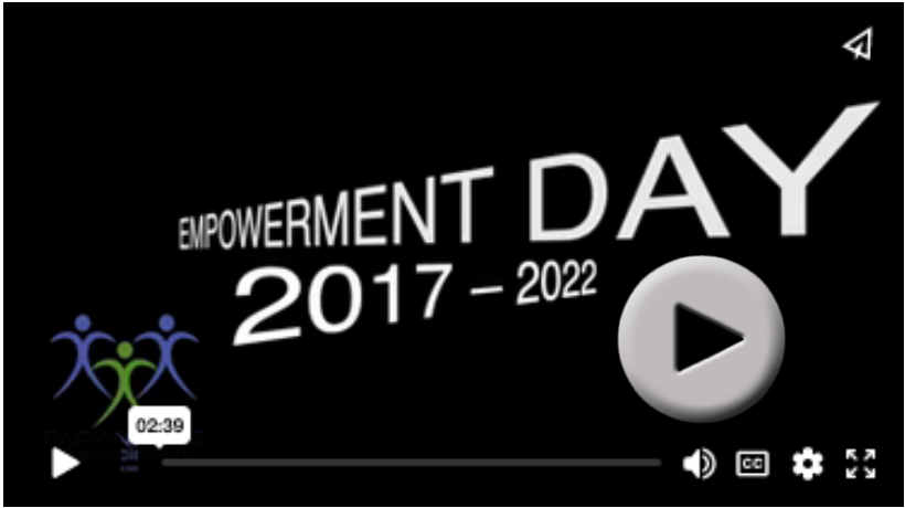
Empowerment Day 5-Year Retrospective Video

Sponsor/Exhibitor’s name and logo listed on Parkinson’s Association of San Diego website and in event booklet.